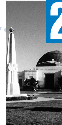
Griffith Observatory

Serving the Red Line, Hillhurst Ave., Vermont Canyon Road, Griffith Park and Griffith Park Observatory